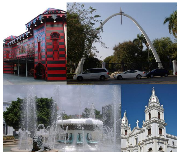
From top to bottom left to right: Parque de Bombas Firehouse, Entrance to Pontifical Catholic University, Lions Fountain in Plaza las Delicias, Methodist Church, Cruceta El Vigia, Playa La Guancha.

The Ponce Art Museum is widely recognized as a world class, premier institution of Italian Baroque, French Academic, and British 19th-century art. It hosts an extraordinary collection of approximately 4000 art masterpieces in a building designed by famous architect Edward Durell Stone (New York's Radio City Music Hall and Museum of Modern Art ), an amazing piece of art in itself, often referred to as the Parthenon of the Americas . Open Wed thru Mon (10:00am-6:00pm) – Admission $6. Daily guided tours at 11:00 am and 2:00 pm.