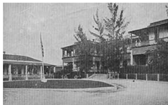
Original Hospital Buildings

The purchase of the Regional Hospital of Ponce was completed in 2000, in order to consolidate hospital medical services for the entire region. In 2007, its centennial year, the San Lucas Medical Tower was also inaugurated. The new medical complex is known as the Hospital Episcopal San Lucas Ponce and offers cutting-edge technology, making this world-class facility available to patients in Latin America, the Caribbean and beyond.