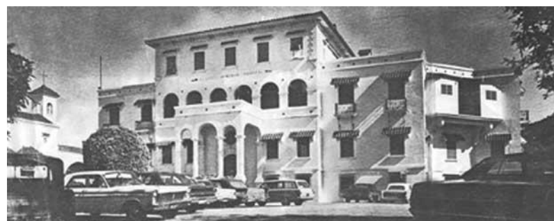
HOSPITAL SAN LUCAS 1931

In 1982 new hospital facilities were opened and that year the first private cardiovascular center was established on the island, where cardiovascular surgeries have been performed since 1983. In 1991 the Ambulatory Surgery Building was inaugurated. In 1998, the Regional Hospital of Guayama, which is called Christ Redeemer Episcopal Hospital was purchased, and in 1999 Episcopal Health Services, Inc., was incorporated in order to centralize all health services of the church under the same structure.