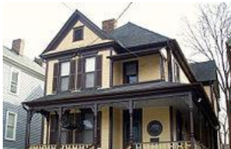
Martin Luther King's childhood home.