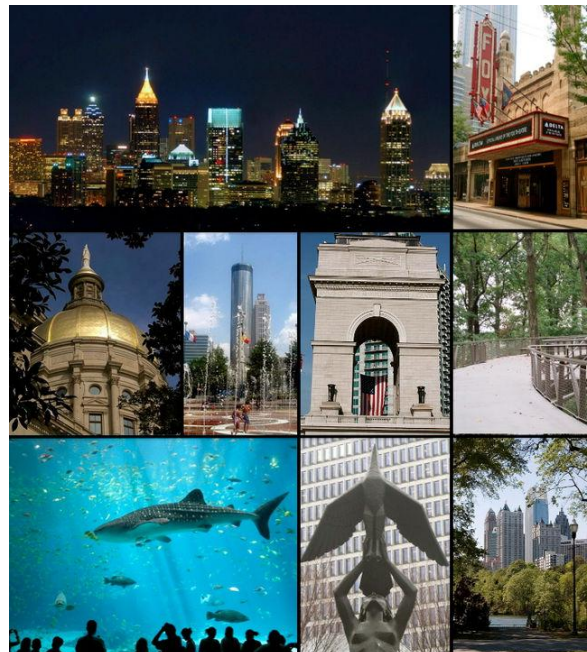
From top to bottom left to right: Atlanta skyline seen from Buckhead, the Fox Theatre, the Georgia State Capitol, Centennial Olympic Park, Millennium Gate, the Canopy Walk, the Georgia Aquarium, The Phoenix statue, and the Midtown skyline.

Transportation in the city is fast and easy to use. Some good sites to check for more information are: travel.usnews.com/Atlanta_GA/Things_To_Do , www.planetware.com/tourist-attractions-/atlanta-us-ga-a.htm , and www.atlanta.net/travel-tours/itineraries/must-see-atlanta . For a good map of the city, with suggested sites to visit, check this link: www.gemn.org/documents/Atlanta-Map.pdf